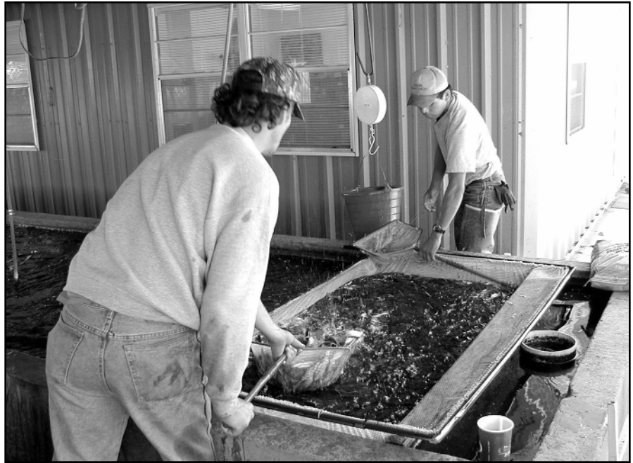
Figure 3. Stored fats are beneficial for maintaining baitfish through the marketing process.

Based on research to date, a recommended growout feed for baitfish would be a catfish diet with 28 percent crude protein and 5 percent additional fat. Catfish diets usually have a total fat content of 6 1/2 to 7 percent (4 1/2 percent fat in the diet and 1 1/2 to 2 percent fat sprayed on the surface), so an additional 5 percent would increase the total fat content to 10 to 12 percent.