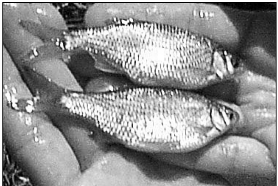
Figure 1. Broodstock nutrition influences the quality of eggs and larvae.

Heavy plankton blooms in shallow baitfish ponds help prevent the growth of aquatic weeds, but