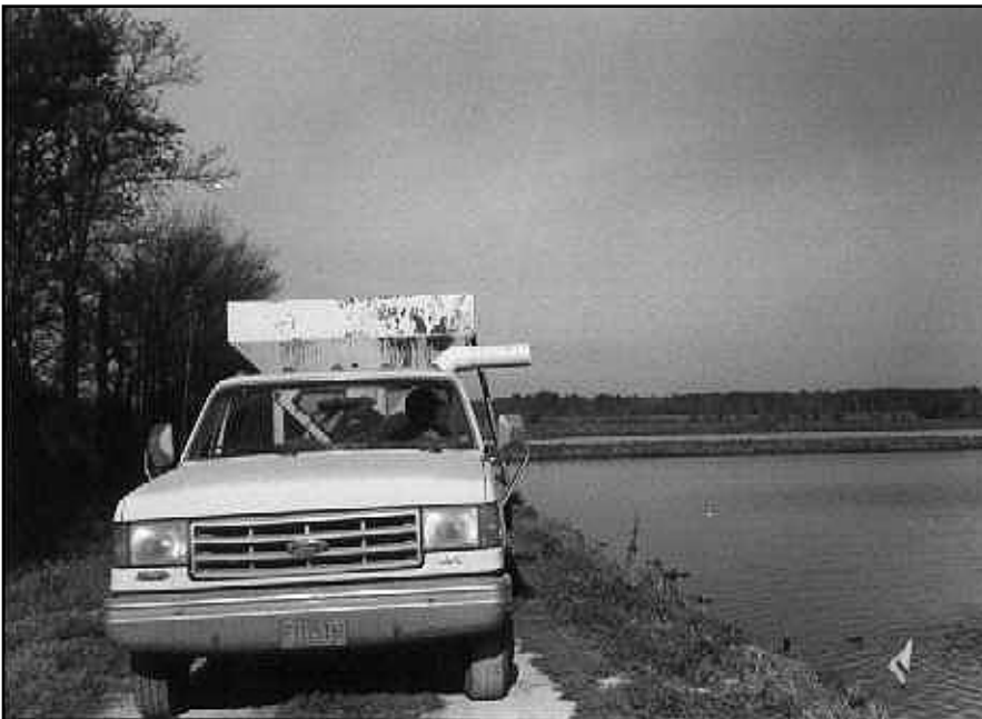
Figure 2. Baitfish producers use truck-mounted blowers to distribute feed.

Starches are energy sources for baitfish species. At a fixed carbohydrate level, complex carbohydrates (starches) improved golden shiner growth more than simple sugars. Within limits, fats and carbohydrates can be used interchangeably as energy sources. Fish grow equally well on a wide range of dietary carbohydrate-to-lipid ratios, from 1:1 (equal amounts of each) to 27:1.